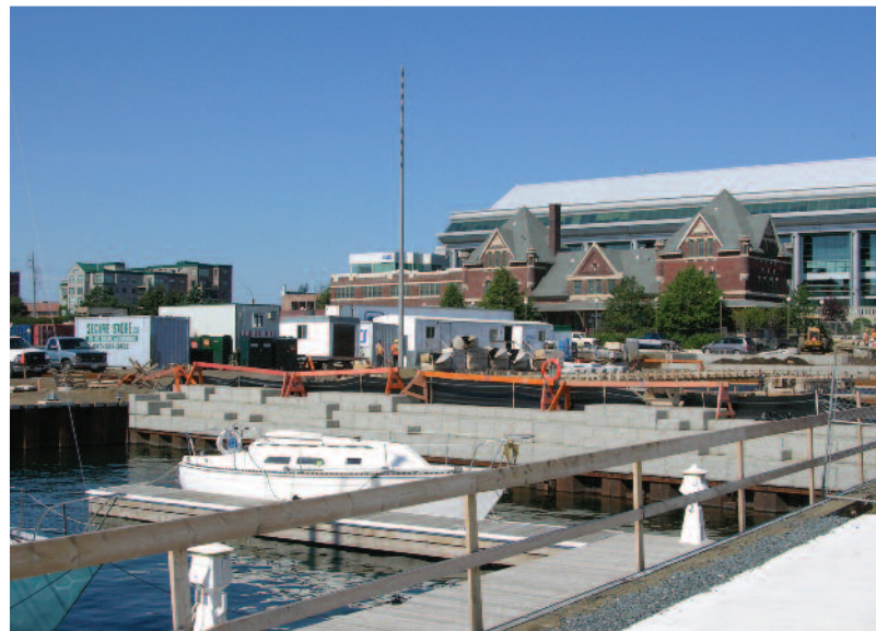
Thunder Bay Waterfront Improvements