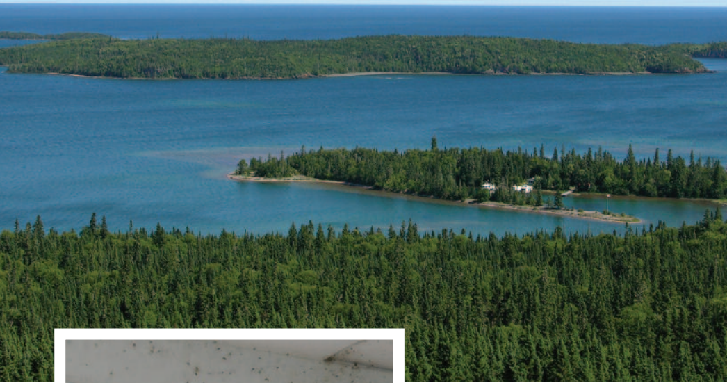
View from St. Ignace