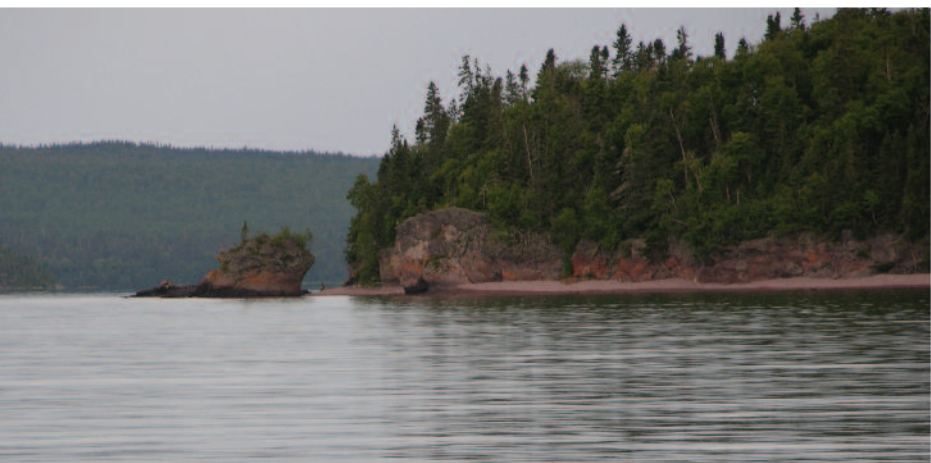
Flower Pots and Red Beaches

boating. The marina is one of the best on the north shore and boasts a well-protected basin, excellent docks with 30- and 50-amp power, gas, diesel, pump-outs and showers.