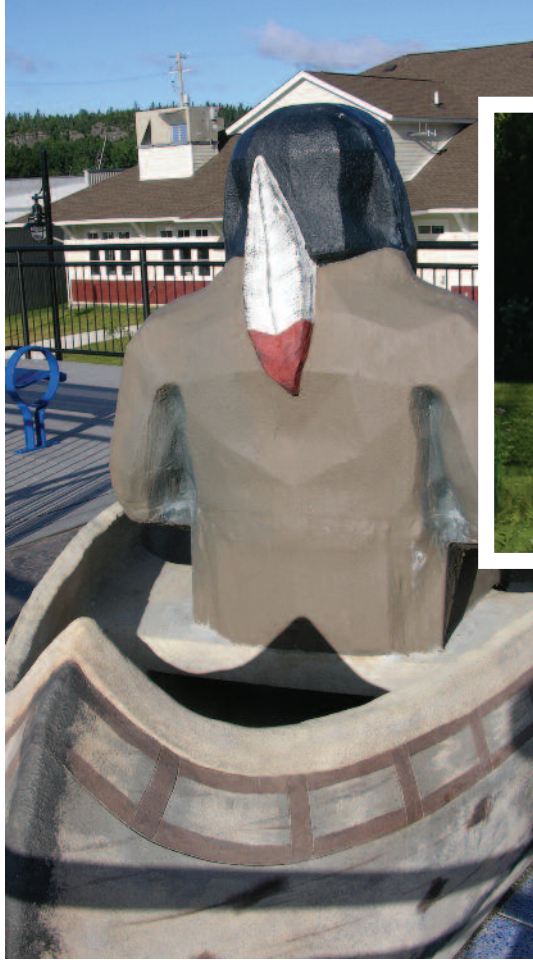
Paddle to the Sea